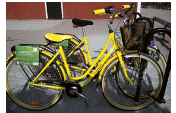
Bicycles for loan in Akalla.

Sweden's Royal Institute of Technology is monitoring the entire project to evaluate it from a technical and behavioural science perspective. A manual that presents the results of the various construction methods and explains how different aspects of the project have been carried out will enable others to make practical use of the results.