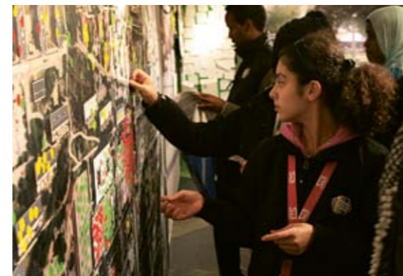
The Järva Dialogue in Akalla, Husby, Rinkeby and Tensta has attracted more than 15,000 visitors.

Technical solutions alone are not sufficient to promote a sustainable lifestyle. At least as important in this respect are a broad-based information campaign and a constructive dialogue with residents that gives them an opportunity to comment on and participate in decisions about the renovation.