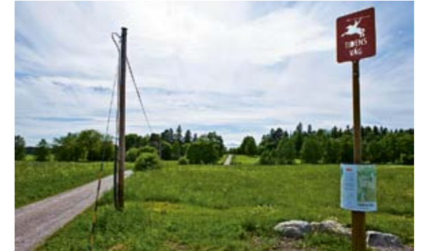
The Path of Time is a signposted walk of cultural history.

Property managers, service personnel and environmental ambassadors in the seven renovated properties are trained to spread knowledge about sustainable lifestyles. Residents are informed about how to save energy, how to sort waste at source and how to discard hazardous waste. All teachers in Järva's schools and preschools are invited to attend environmental training courses, and local clubs and societies are offered training in environmental and climate-related issues.