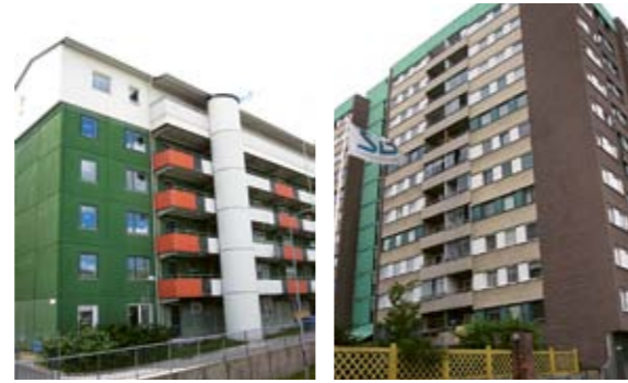
3-storey block in Rinkeby, balcony-access block in Husby, and high-rise slab block in Akalla.